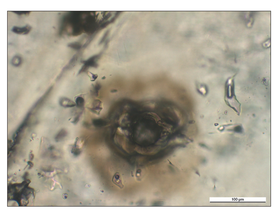
Figure 1. Magmatic fluid inclusions in quartz from Cerro Rico de Potosi, Bolivia. This is the site of the world's largest silver deposit which has produced more than 2 billion ounces of silver since 1544 and was exploited by the Conquistadors. The figure shows a range of fluid inclusions with a central vapour bubble. A few high salinity inclusions have precipitated a salt crystal on cooling, which appears as a white square shape. In the centre is the crater remaining from the ablation of a single fluid inclusion—other inclusions nearby are unaffected.

The scientific study of fluid inclusions goes back to the middle of the 19th century, when Henry Clifton Sorby, a pioneer of using a microscope to study rocks, recognised that many of the granites and other crystalline rocks he was studying contained small bubbles of water in their quartz crystals, mostly with a small vapour bubble and, in some cases, salt crystals. Geochemists have sought for years to find techniques that would allow them to analyse the contents of these small liquid bubbles, but the challenge is formidable. The inclusions are very small indeed; it is often obvious from their appearance and behaviour when frozen that not all the fluid inclusions in