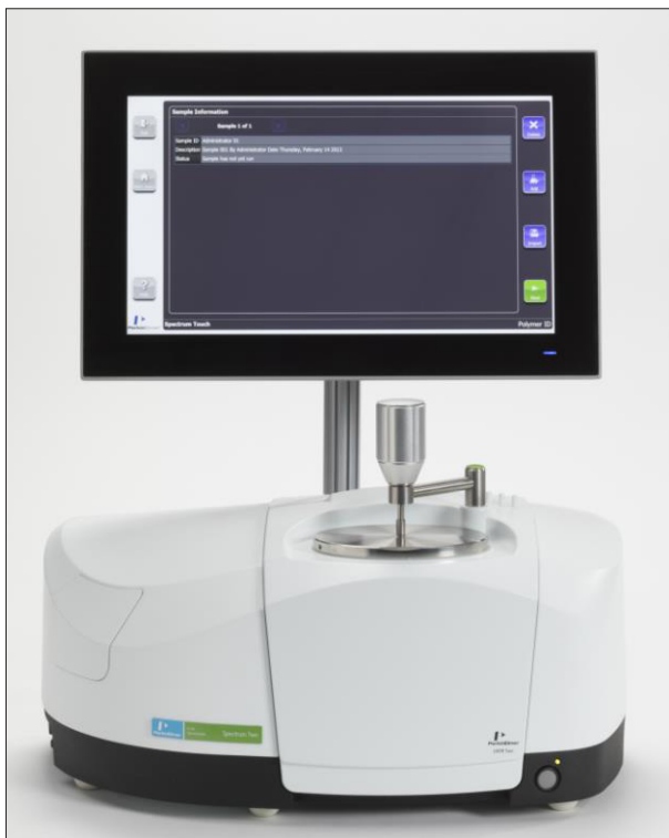
Figure 1. PerkinElmer Spectrum Two+ FT-IR spectrometer with ATR accessory.

Stock solutions of ethanol and isopropanol (Sigma-Aldrich) were used to prepare calibration and validation standards. Calibration standards from 0-90 % (v/v) ethanol and isopropanol were prepared, by volume. Each standard was made up such that all contained the same quantity of glycerol and hydrogen peroxide (1.45 and 0.125 % v/v respectively) and the correct proportion of the alcohol. Solutions were made up to 50 mL using deionised water. All samples were measured using the PerkinElmer Spectrum Two+ FT-IR spectrometer (Figure 1) with attenuated total reflectance accessory using the parameters shown in Table 1.