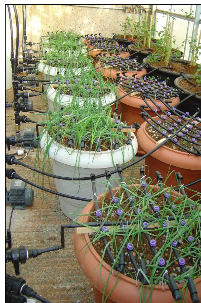
Figure 1. Photograph depicting the three parallel greenhouse series for cultivation of green onions, carrots and potatoes. The permission of Elsevier to reproduce this figure is acknowledged.

The tubers were irrigated with water solutions containing different levels of Cr(VI) and Ni(II), prepared by solid K_2Cr_2O_7 and NiCl_2 \cdot 6H_2O , respectively. The six lines, of three tubs per line, were watered as follows: 0 (control), 10 \mu g L^{-1} , 20 \mu g L^{-1} , 50 \mu g L^{-1} , 100 \mu g L^{-1} and 250 \mu g L^{-1} in tap water solutions of both Cr(VI) and Ni(II). All the plants were regularly fertilised. At harvest, carrots, potatoes and green onions were taken from the tubs, separated from non-edible parts, peeled, macerated, freeze dried and pulverised by mortar and pestle. Samples of pulverised plants were then diluted in