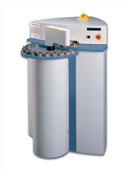
Figure 1. Thermo Scientific ARL OPTIM'X XRF Spectrometer with its 13-position sample loader.

Didier Bonvin, Product Applications Manager XRF Ling Yok Ung, Application Specialist