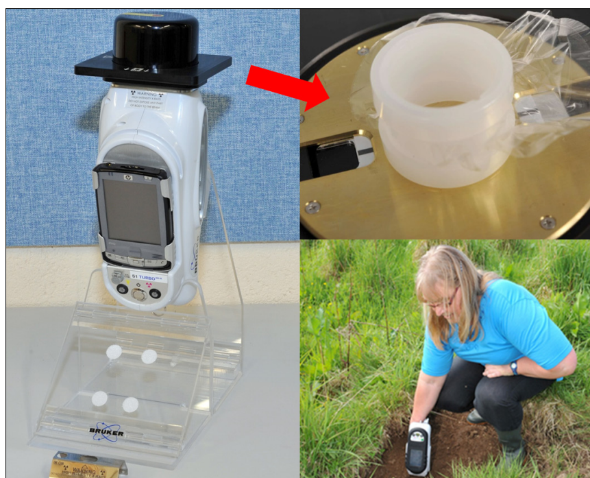
Figure 2. Portable XRF instrument on stand with sample holder and film located under the radiation shield. The inset (bottom right) shows portable XRF being used in the field.

FT-IR spectra of the milled soils were recorded on a Bruker Vertex