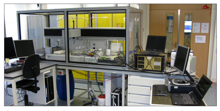
Figure 3. Zinsser robot at the Expert Capability Center in Deventer with integrated automatic spectroscopic analysis of the liquid samples created by the other high-throughput liquid handling robot.

see in everyday experiments which are unexpected.